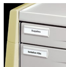
Drawer Label Holder