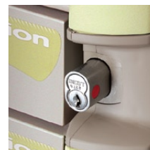
Best® Core Locks*