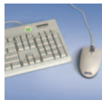
Infection Control Peripherals