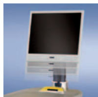
Monitor Height Adjustment