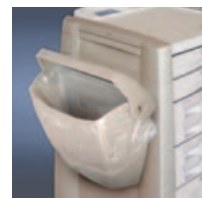
Waste Container with Lid