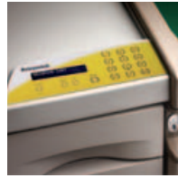
Keyless Access with Auto-Relo