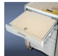
Keyed Narcotics Drawer