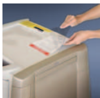
Clear Top Mat