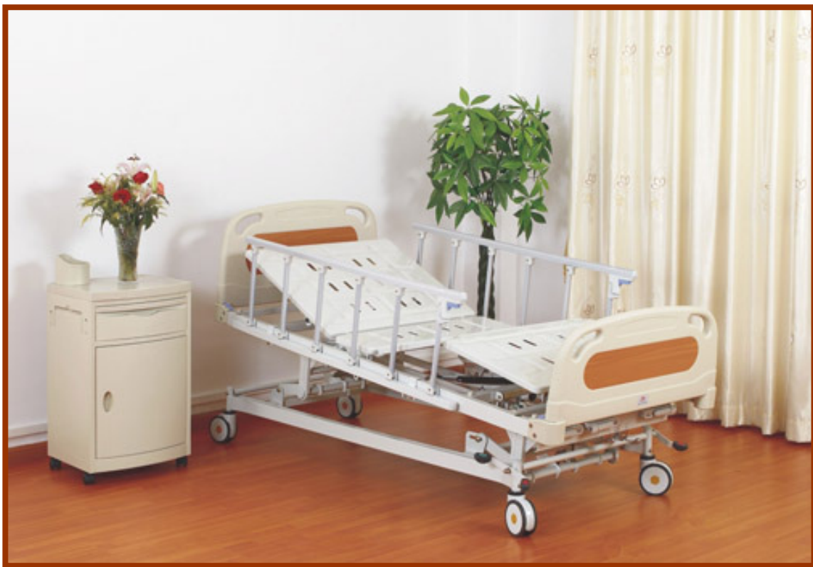
Ca638a-m Three crank manual bed