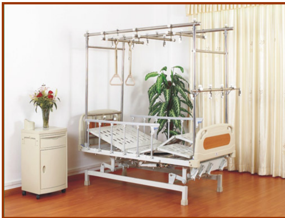
Ac05 Orthopaedic traction bed with balken frame