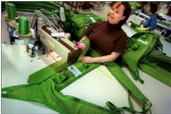
Our own production of the world-renowned green slings makes it easier for us to develop new models when demands are changing.

Accessories include various types of heavy duty slingbars, scales, stretchers, and other options designed to make bariatric lifting safer and easier for all concerned.