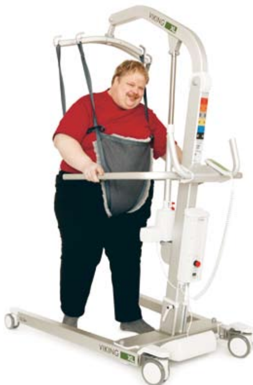
Gait training with Viking XL and the Liko Lift-pants. The lift is equipped with optional arm rests.