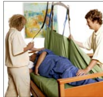
Repositioning of heavy patients is made easy with the Stat RepoSheet™.