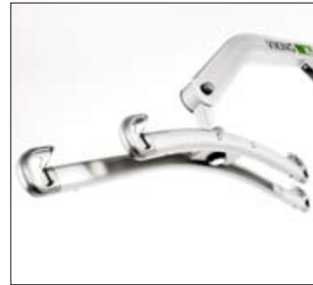
Choose between a variety of slingbars in different widths.