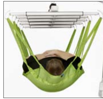
Several different horizontal lifts and lift sheets are developed for bariatric lifts.