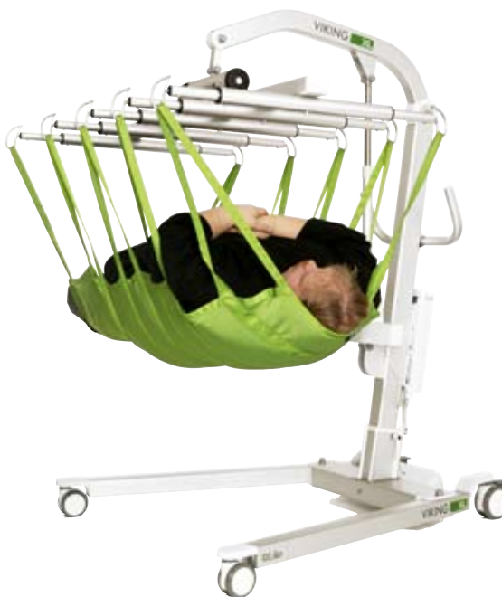
Horizontal lifting with a Viking XL equipped with a FlexoStretch and XL horizontal lift sheet.

When fitted with optional pivoting arm rests, they can be used for ambulation assistance, gait training, or enhanced caregiver maneuvering leverage.