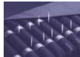
Low Air Loss