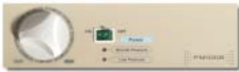
Easy Control Panel with Low Pressure Indication

Apex adopts the Dynamic Pressure Monitoring System to trace the real-time internal pressure of the mattress and develops a series of state-of-the-art mattress overlay and replacement system for the prevention, treatment and management pressure ulcers.