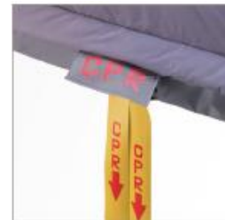
CPR Quick Release