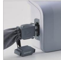
Quick Connector Transport Function

Mattress: 5" Overlay Maximum Patient Weight: 200kg